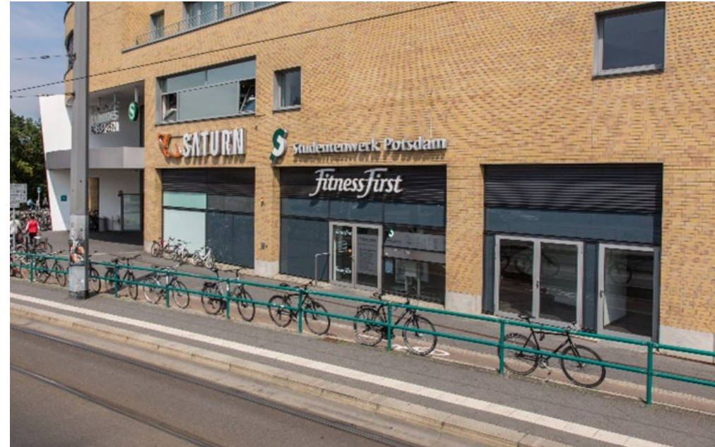
Outside view of the Studierendenwerk headquarter

Phone office hours: Mo and Thu 9-12 a.m.