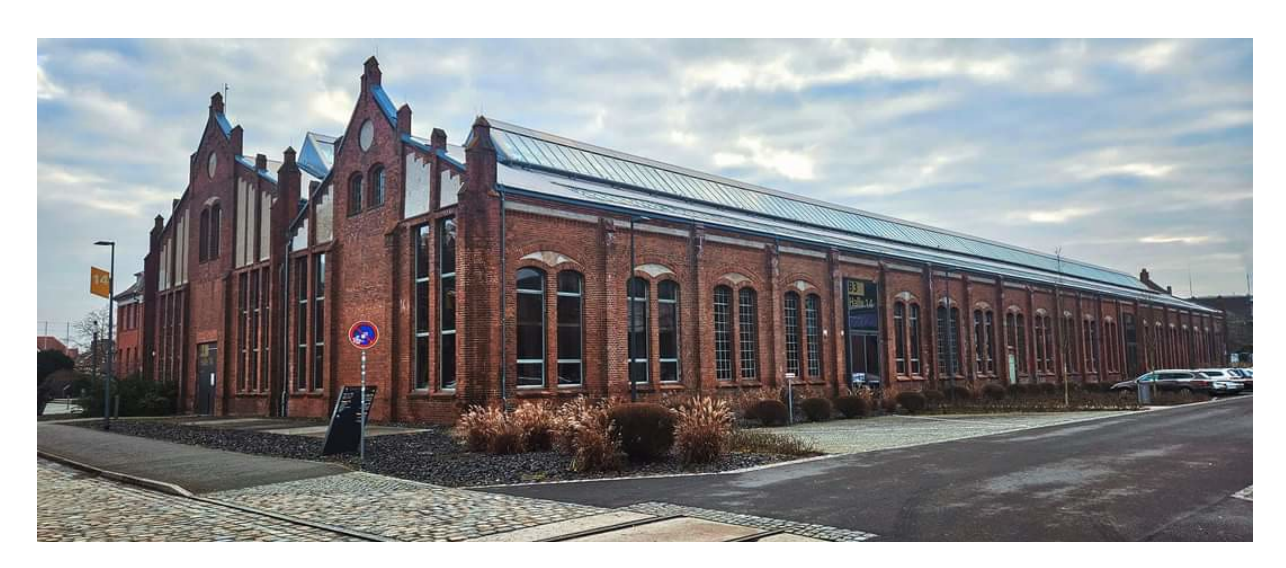
Technische Hochschule Wildau - © Image: Adriana Wipperling-Klepke